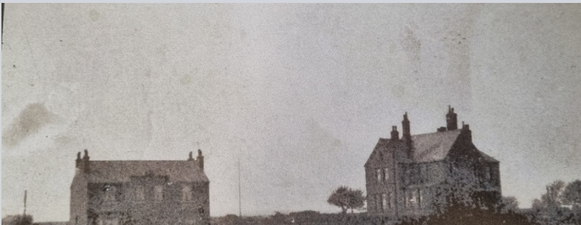
The Withins, on the right shortly after being built in 1908,